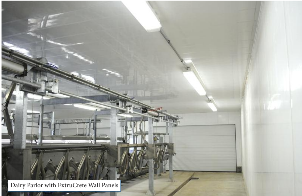
Dairy Parlor with ExtruCrete Wall Panels

ExtruCrete panels create a superior sanitary surface that is designed for durability and cleanliness, combining the strength of concrete and the easy-to-clean finish of Extrutech Poly Board® panels. This creates a non-porous, prefinished, precast, structural panel that reduces finishing and installation time of the construction project. The end result producing a bright white, sanitary, easy-to-clean wall that will make everyone's day brighter.