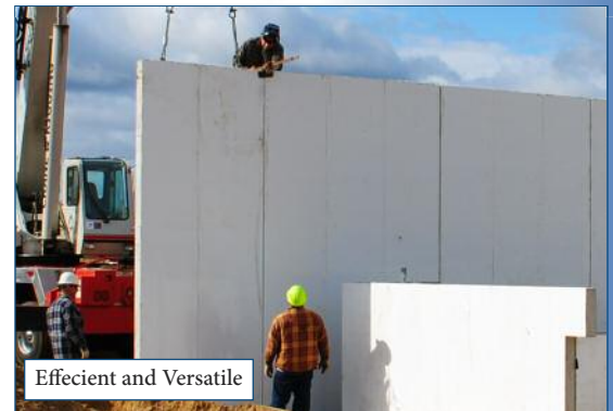
Efficient and Versatile